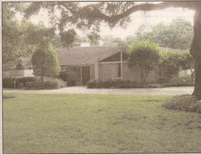
CONSUL GENERAL'S HOME BEFORE THE RENOVATION